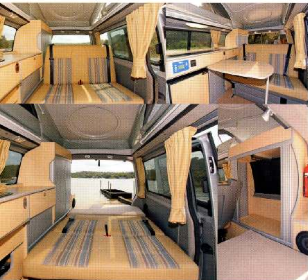
Above and top left: The rear seats convert to a double bed. Top right: An 85L fridge can be found in the kitchen. Above right: A rear wardrobe is provided for clothes.

fluorescent above the kitchen bench, halogen reading lights at the rear for reading in bed plus a couple of roof lights along the nearside. Neither the driver nor passenger seat get a reading light.