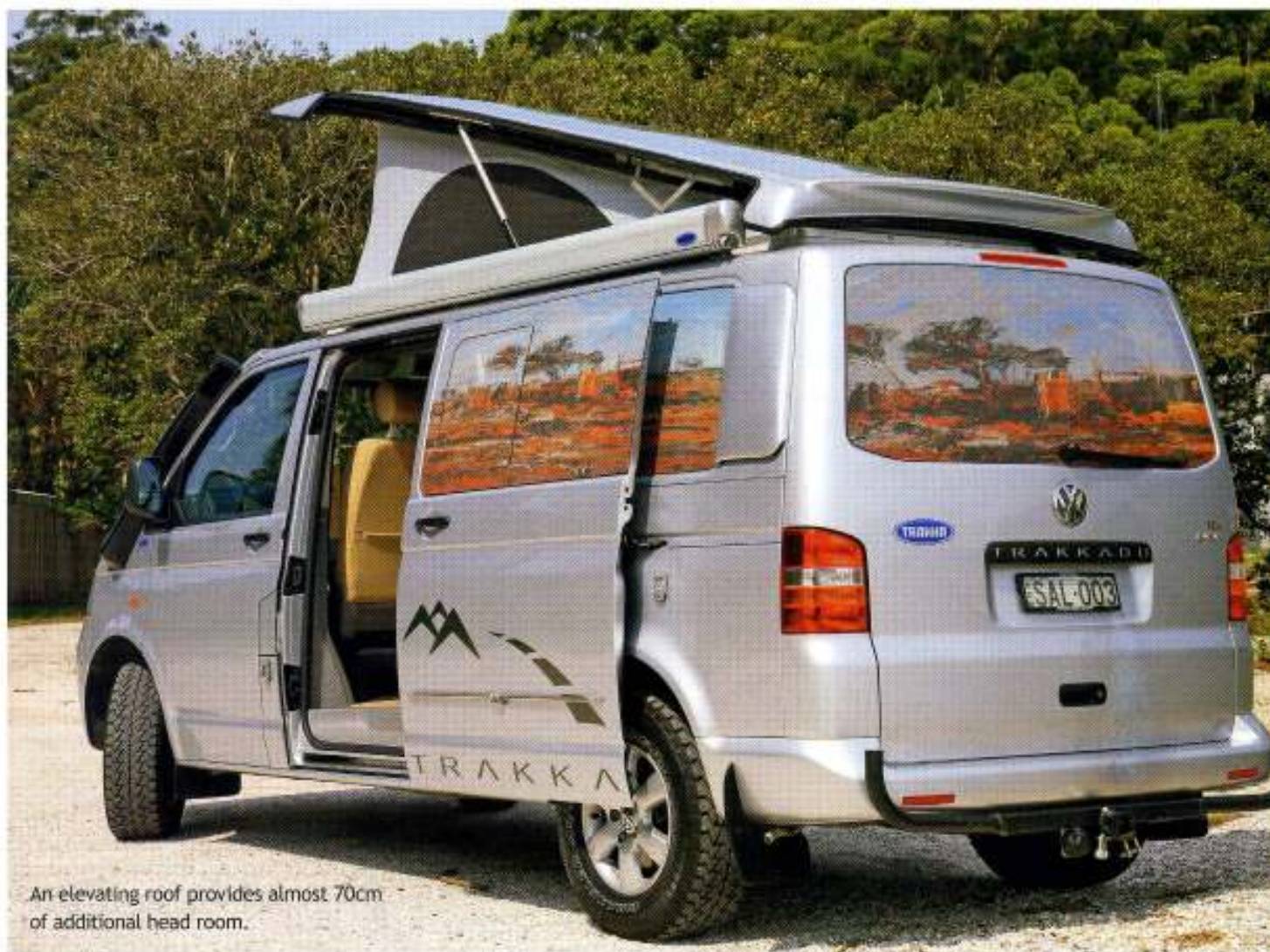
An elevating roof provides almost 70cm of additional head room.