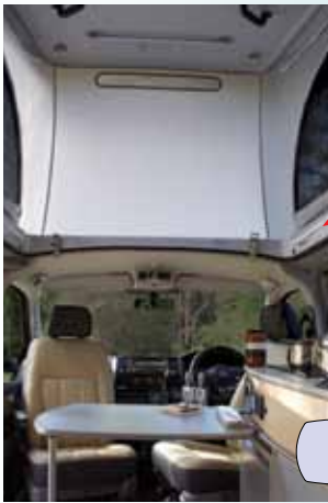
Loads of headroom and ventilation