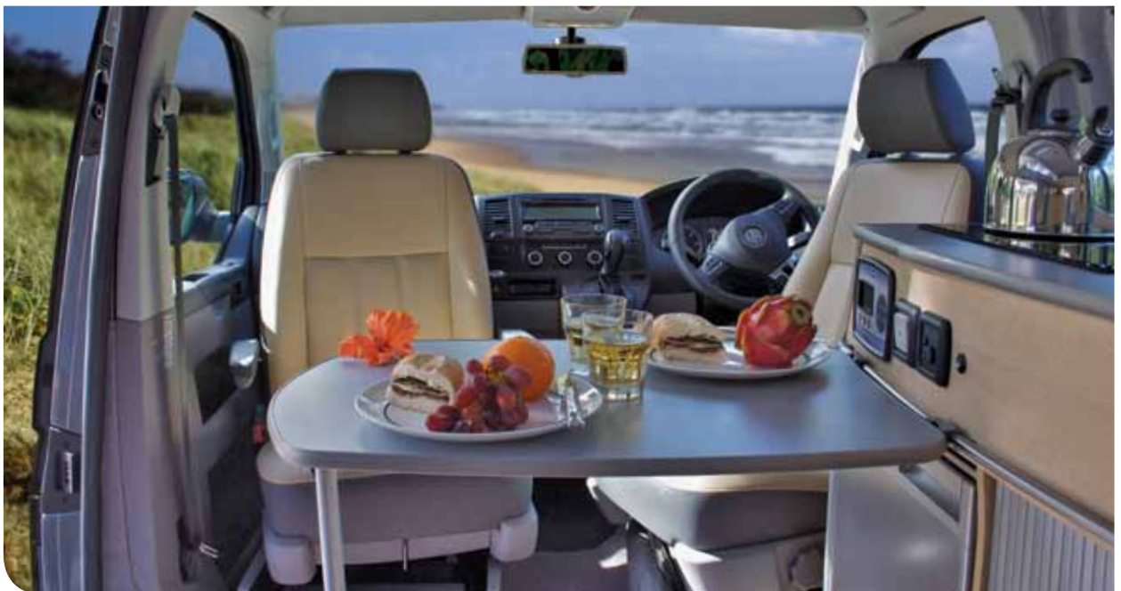
Dining with the best views.

Great Galley Brimming with ingenious features the TRAKKADU kitchen has the latest in efficient refrigeration, stainless steel sink with lid and a diesel-powered cooktop with an elegant ceramic surface. This cooker is very simple to use, easy to clean, safe and reduces the fuel sources required. Stylish roller doors and drawers feature in the ergonomically designed curved cabinets, built from a superior light-weight, HP laminated Euro-plywood. The freshwater and greywater tanks are housed safely within the TRAKKADU cabinets.