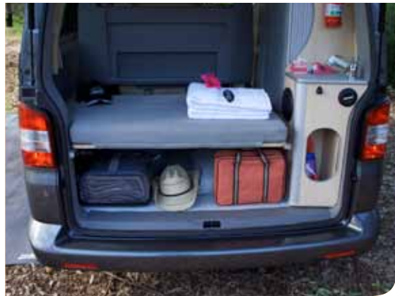
Plenty of rear storage