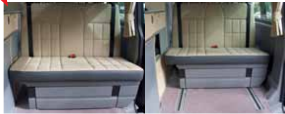
Ingenious multi-position seat with integrated safety belts