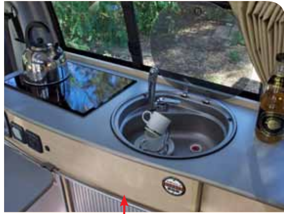
Practical and stylish kitchen