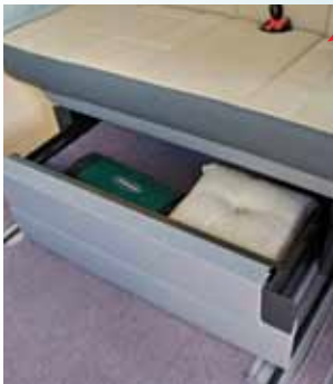
Handy storage under seat