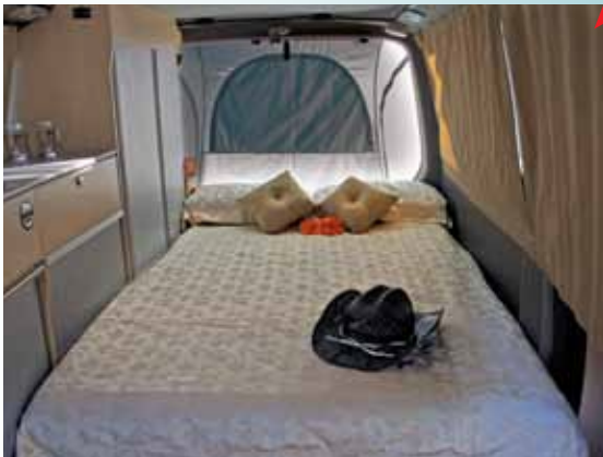
Seat folds simply to a comfortable double bed