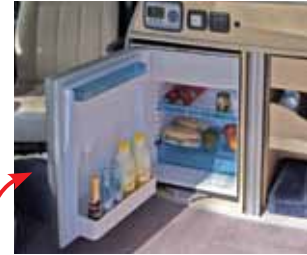
Efficient fridge and freezer