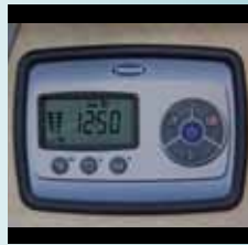
Easy electronic monitoring