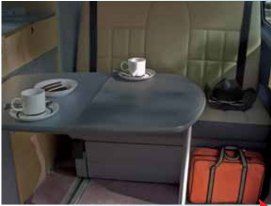
Versatile seat and table positions (leather option)