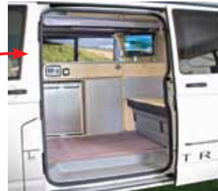
Contemporary cabinetry (TV option)